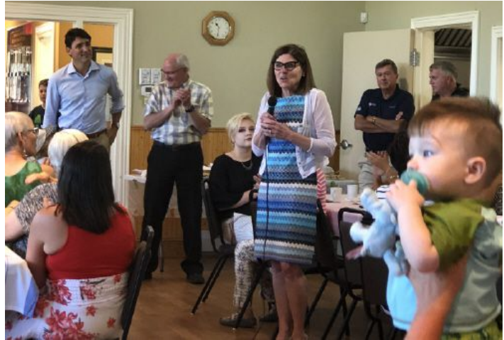
PEI Seniors at the 2018 Halifax Convention & back on the Island

In 2018, the Commission's National Board adopted a new Vision (quoted above) and a new Mission statement: “To inspire older Canadians to participate in the political affairs of Canada and to provide the Liberal Party of Canada with insight and understanding of the interests and needs of Canada's current and future senior citizens.”