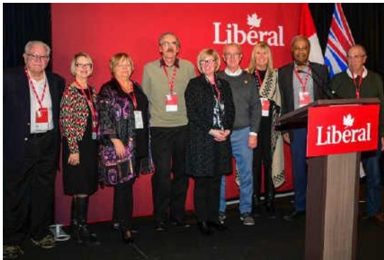
SLCBC Exec & Speakers in Kelowna